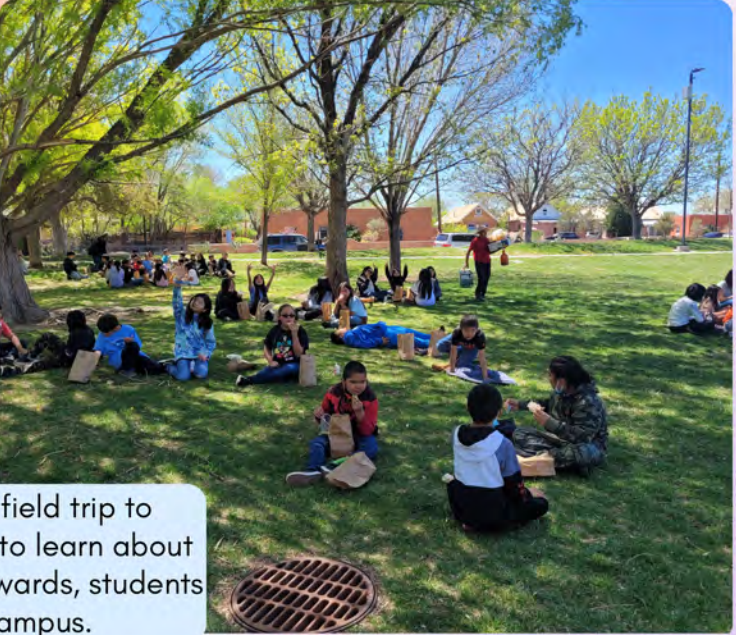
On Wednesday, April 17th, TILC 4th graders took a field trip to Albuquerque's Explora Science Center. Students got to learn about several subject such as air, electricity, and light. Afterwards, students had lunch in the park before driving by UNM campus.