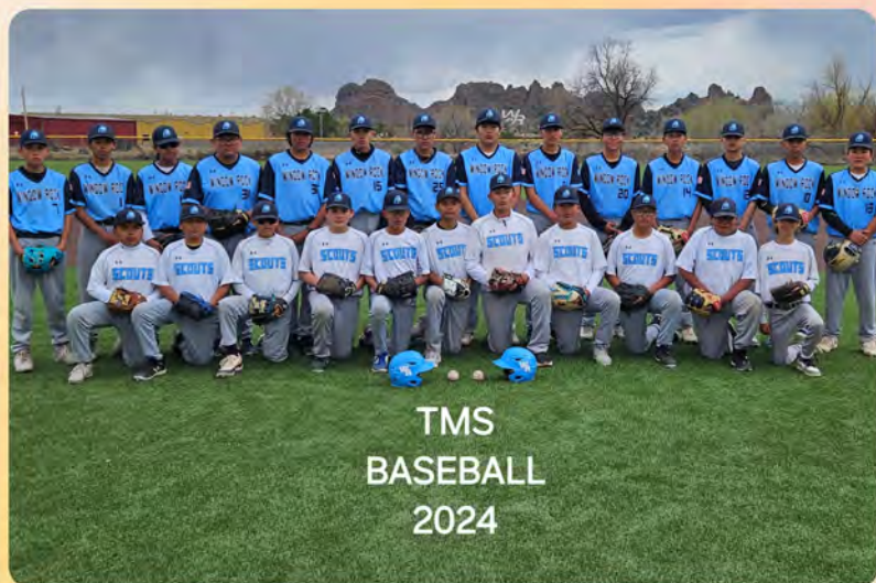
TMS BASEBALL 2024

This year, TMS softball had ten (10) TILC 6th grade students on their JV team. Congratulations on a great season!